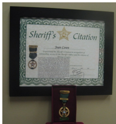
(Above: Orange County Sheriff's Office Citation Award)